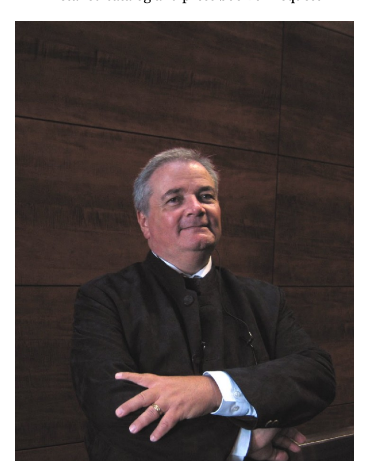
Detailed catalog and press book on request